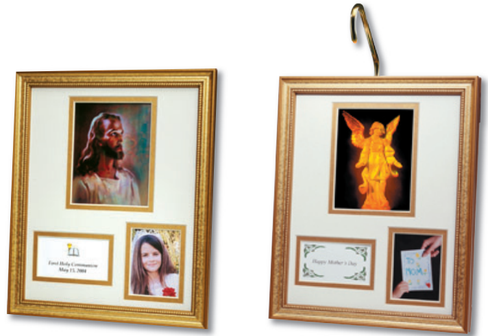
First Communion Morning Glory Celebrite™

Responding to customer requests, we initiated a special production of the “First Communion” Morning Glory Celebrite™. A Eucharist cross appears on top of a portrait of Christ when light shined on it from above. The Original and Morning Glory Celebrite™ are unique family keepsakes that celebrate any special occasion. They are easily personalized by replacing the included wallet size picture with a photo.