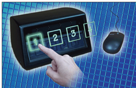
BeamOne "Plug&Play" interface