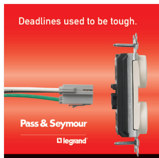
Front phase 2