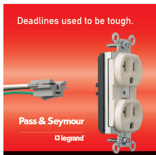
Front phase 1

a “3 flip” lenticular hanging poster. As customers in the store walk by, they see the Plug Tail move towards and then mate to its AC receptacle. “Having point-of-purchase (POP) signage with visual motion was critical in communicating our client’s message,” comments project manager Marc DiFrancesco of Paradigm Graphic Solutions. “We were pleased that Rayvel was able to deliver the project quickly and within the budget.”