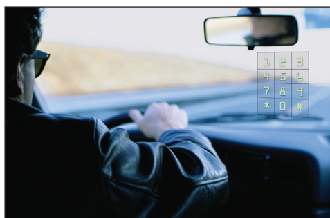
Controls projected at a convenient location